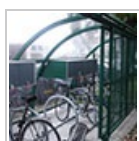
Helmet lockers 10 lockers