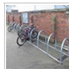
Cycle racks 0 cycle parking spaces