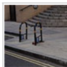
Sheffield stand 0 cycle parking spaces