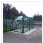
Covered sheffield stand 10 cycle parking spaces