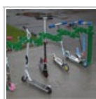
Scooter parking spaces 30 spaces