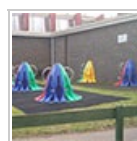
Other cycling parking spaces 0 spaces